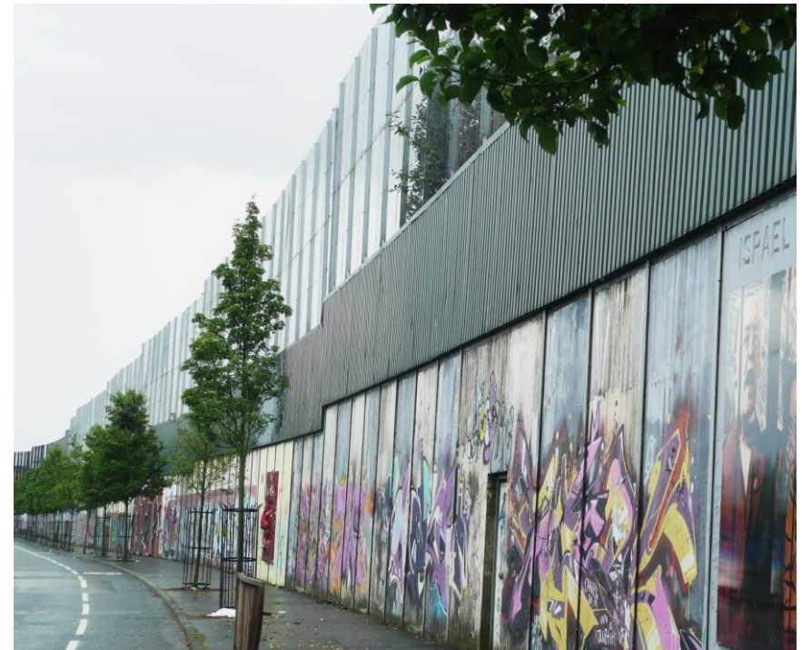
Peace Wall in Belfast

What parallels do you see with historical events in other countries? Discuss with your partner and summarize your ideas in a few sentences for your class.