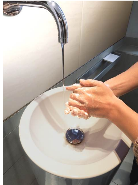
Figure 1: Washing hands.

It certainly isn’t possible to get rid of the greasy film on her skin with plain water and no soap; her hands won’t get clean. But why does it come off right away with soap?